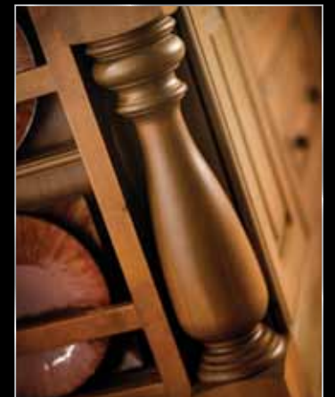
A few of the Turned Post options for Tables and Islands are pictured above.